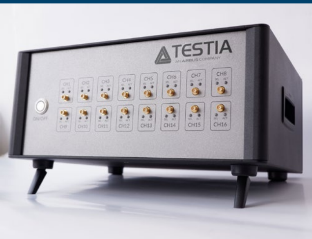
PF-16 (portable equipment)