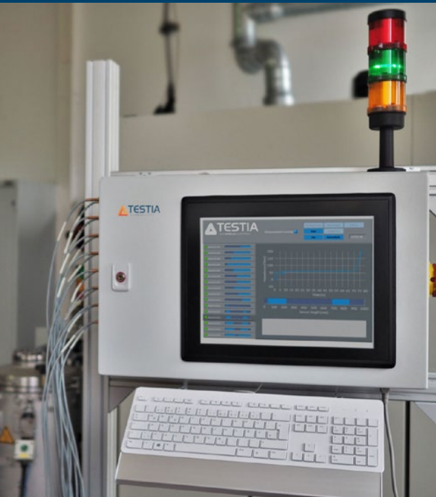
SF-16 (embedded system)